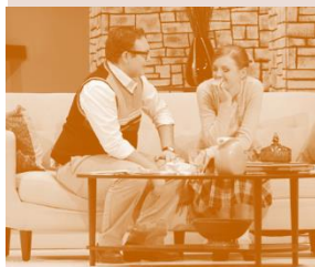
MARCOS DE NIZA