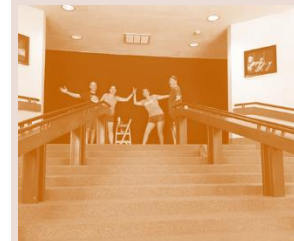
MARCOS DE NIZA