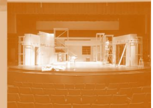
PARENTS & FRIENDS

If everyone gives a little we can make a positive impact in our children's high school experience. Please consider volunteering: